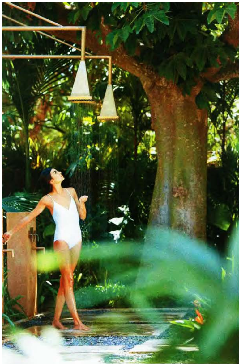
Whether enjoying an outdoor shower (top left) or relaxing in an infinity-edge pool (bottom left), guests are rejuvenated by sun and fresh air.