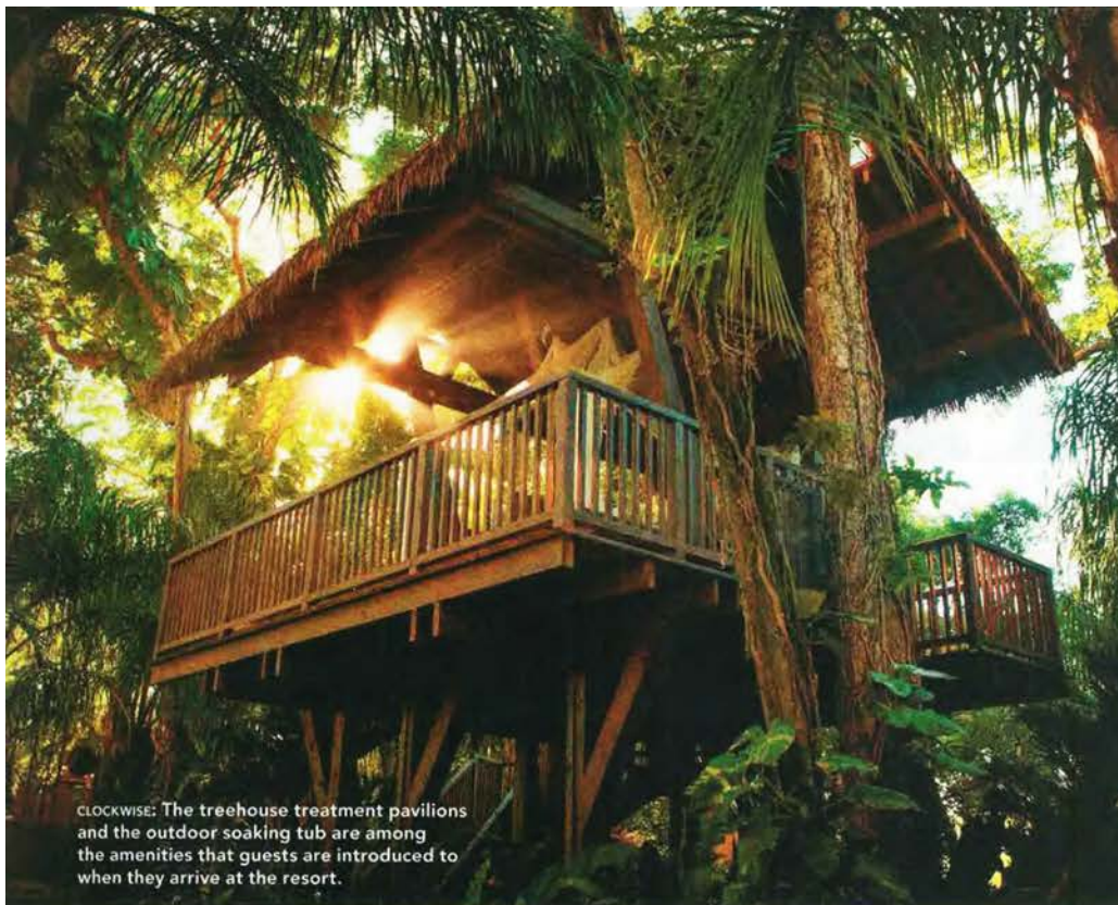
CLOCKWISE: The treehouse treatment pavilions and the outdoor soaking tub are among the amenities that guests are introduced to when they arrive at the resort.