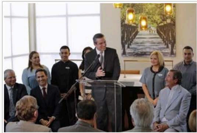
Gov. García-Padilla offers his remarks during the ribbon-cutting ceremony for the newest Hyatt property to open in Puerto Rico.